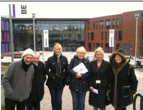
St Anne's Governors having a sneak preview of The Oldham Academy North before it opened to pupils.