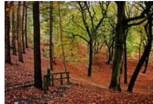
Tangle Hill Park, Royton

What changes can we observe in our local area during the different seasons?