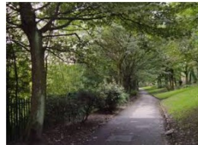
Dunwood Park, Shaw